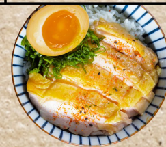
*Chicken Bowl 8.95