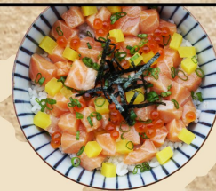
*Salmon + Ikura Bowl 11.95