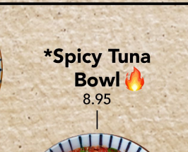
*Spicy Tuna Bowl 🔥 8.95